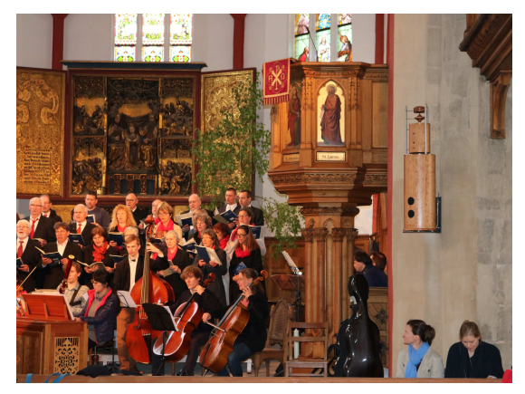
ETERNITA in the Church of St. Afra, Meißen (Germany)