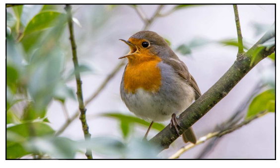
Little bird, singing in the woods.

In conversation we not only hear the words but also have a feeling what another person wants to communicate. With our sense of hearing we have a connection with everything that surrounds us.