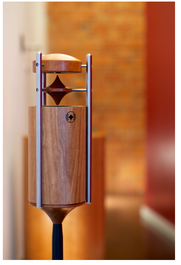
SUNRAY for your home.

The mid/high systems form an excellent acoustic hologram, clear and fine through all frequencies, which makes you feel entirely comfortable.